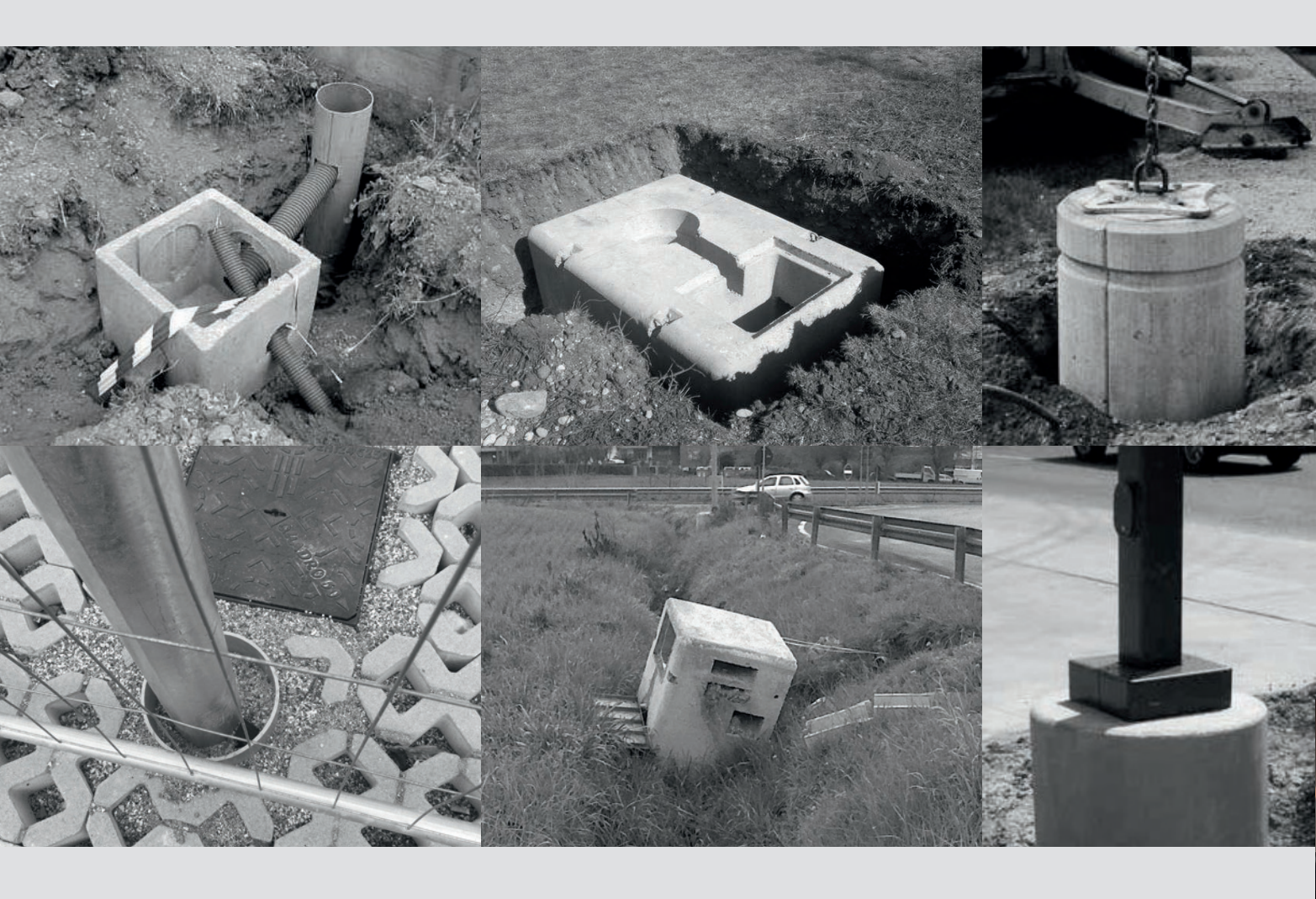
THE FUTURE - THE ATLANTECH LUX TECHNOLOGY